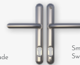
SmoothFold Sweet Door Handle