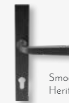
Smoothfold Heritage Handle Upgrade

The hardware that you choose for your new SmoothFold bifolding doors is important, that is why you need products that are attractive and durable in equal amounts, rest assured all our hardware options provide these in abundance - the only decision is what is the best option for your home.